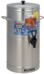
TDS-3, 3 GAL