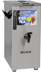
TD4T, BREW THRU LID NUDGER HDL