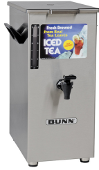
TD4T, SIGHT GAUGE NUDGER HDL