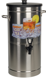
TDS-3.5, 3.5 GAL