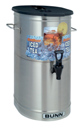
TDO-4, RESERVOIR BREW THRU