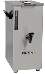
TD4T, BREW THRU LID NO DECAL NUDGER HDL