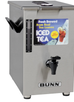
TD4, BREW THRU LID SWT/UNSWT HDL